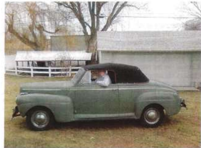
Here is a picture of Jack Yale's newest, a 1941 Ford