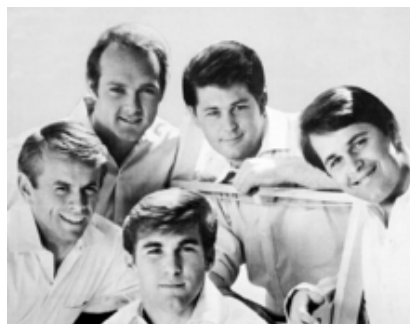
The Beach Boys, 1964

Written by Brian Wilson of the Beach Boys and Jan Berry of Jan and Dean, the song became the first surf song to hit No. 1 on the charts, in 1963.